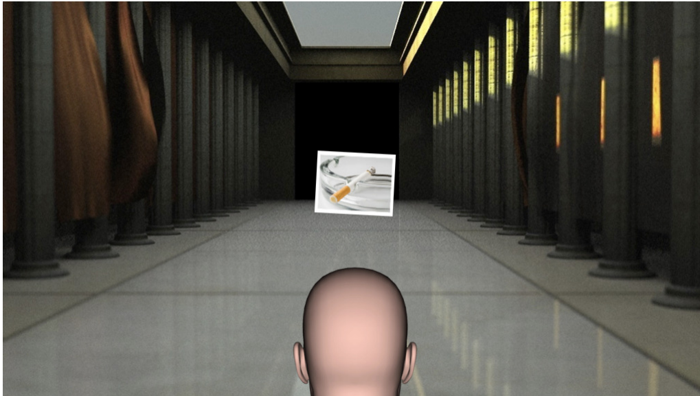
Figure 1. Visual background of the IF-VAAST

Note. In this example, the stimulus is tobacco-related and tilted to the right.